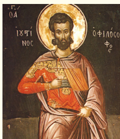
St. Justyn Martyr