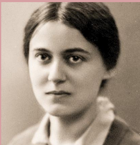
St. Edith Stein