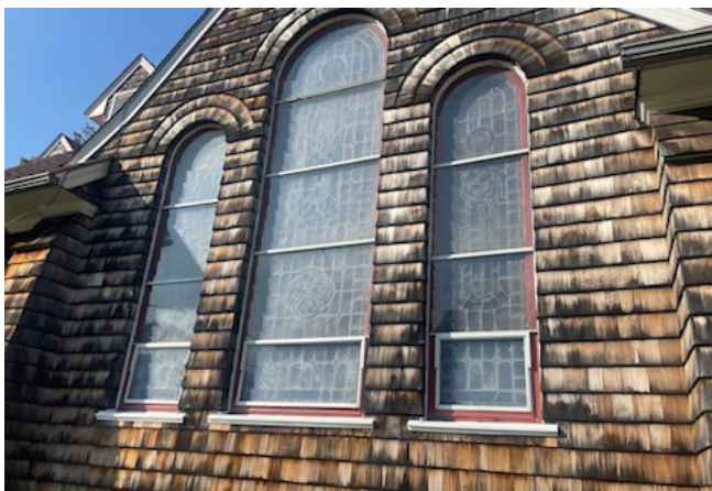
St. Thomas More has new window sills (above) and shingle repairs below, using funds from the annual collection.