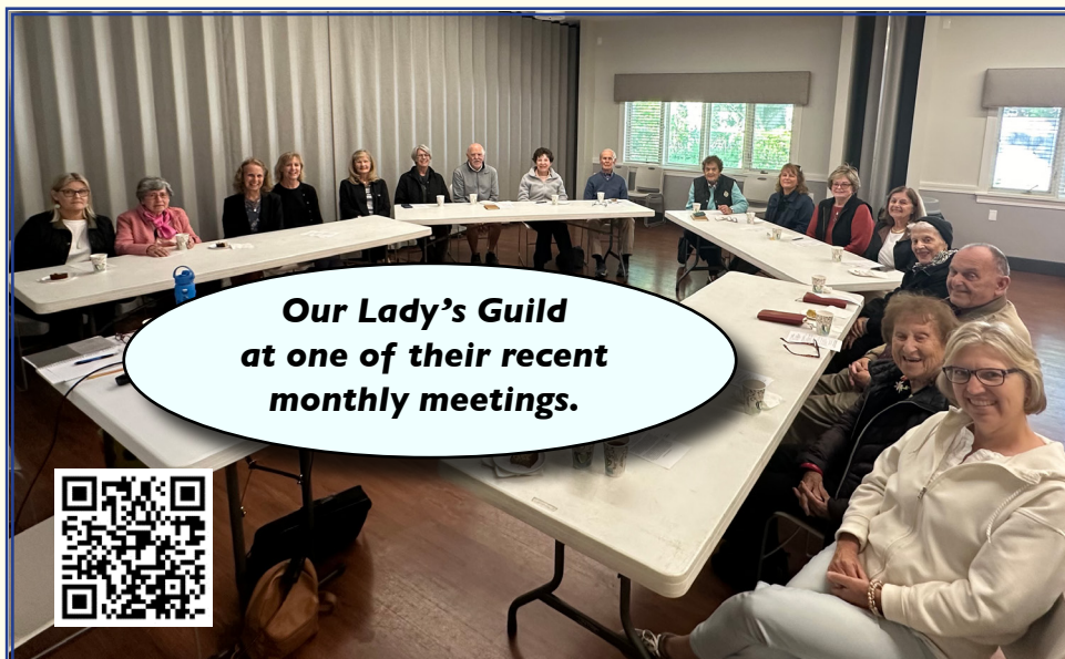
Our Lady's Guild at one of their recent monthly meetings.