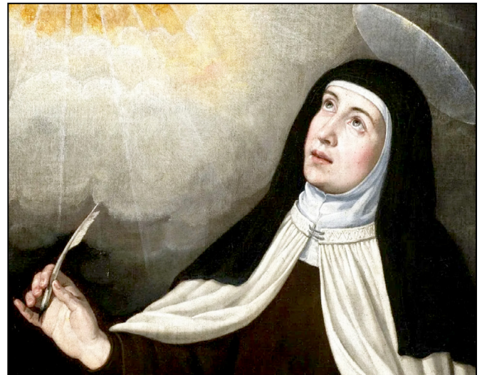
St. Teresa of Ávila