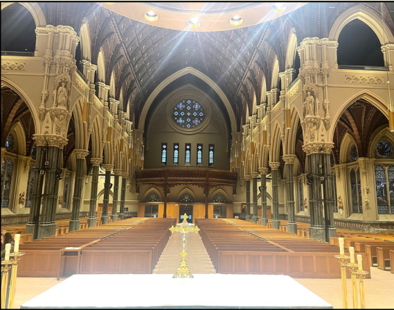
Confirmation students tour the Cathedral of SS. Peter and Paul in Providence.