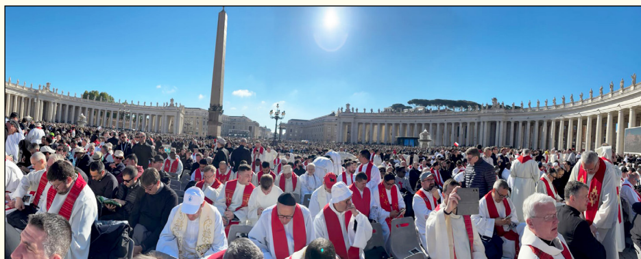
Priests before Mass.