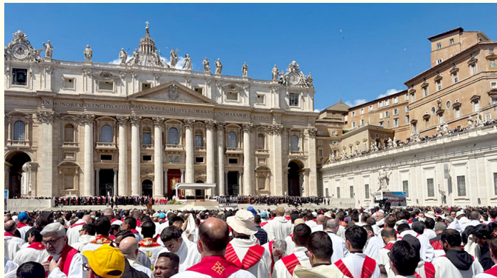
Body of Pope Francis being taken out of St. Peter's Square.