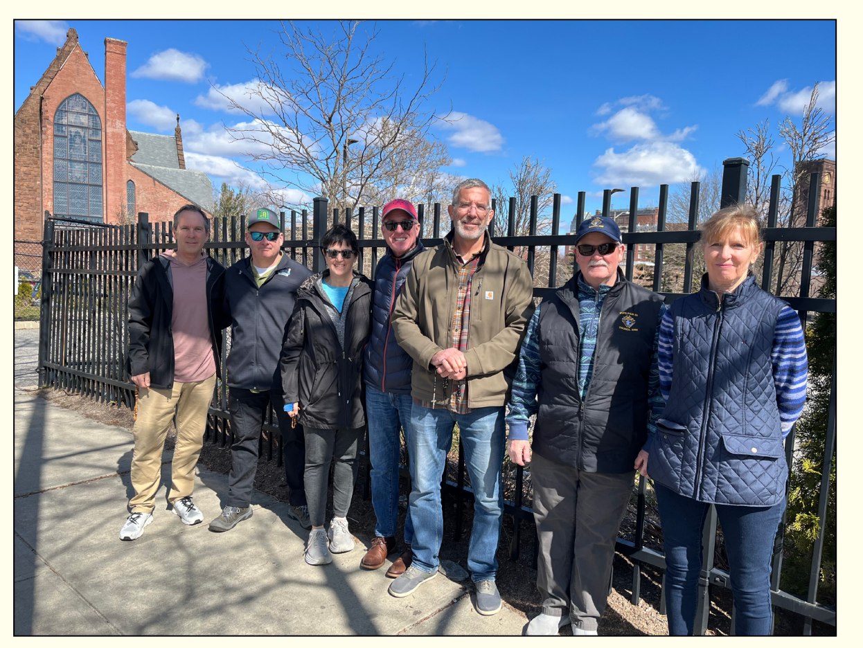
Above: Rosary group outside Planned Parenthood last Saturday. Below: Celebration after Mass on St. Josehp's Day.