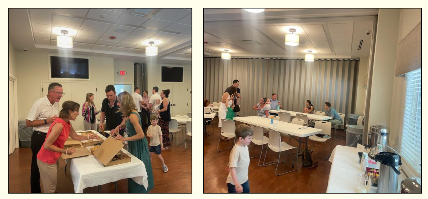
Reception for families with newly baptized children.