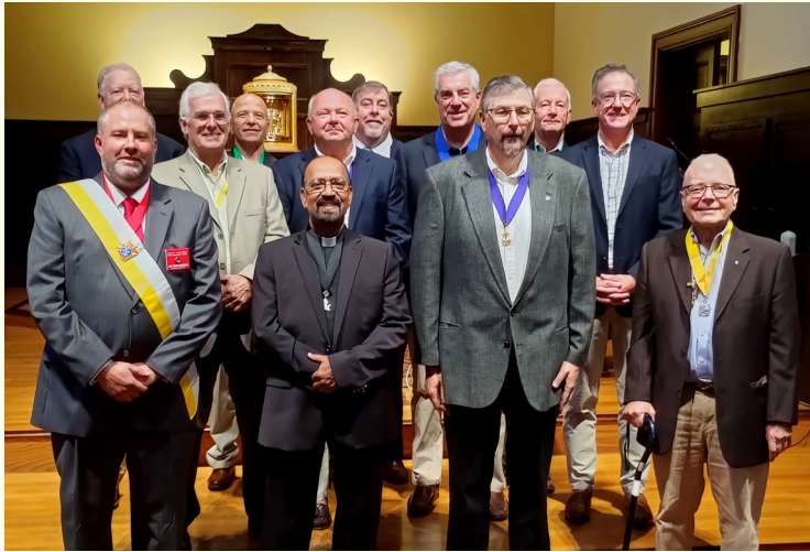
Knights of Columbus, Installation of 2023-24 Officers.