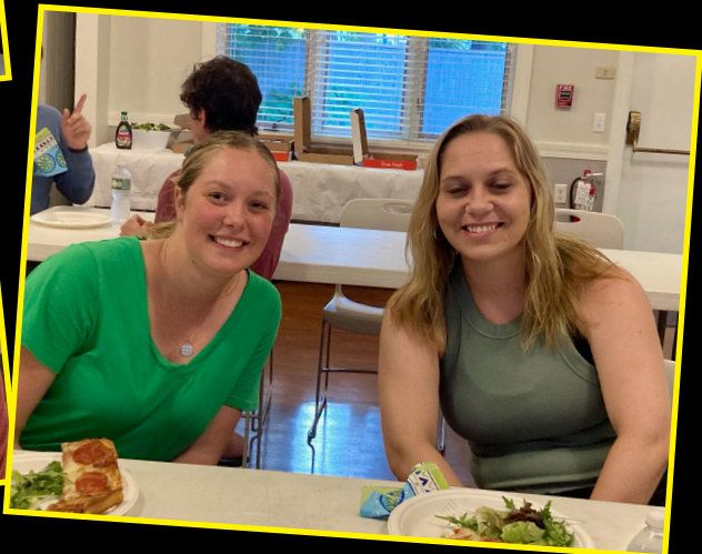
Blessed Pier Giorgio Frassati