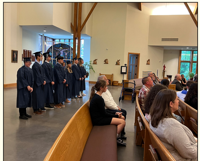
Monsignor Clarke School Graduation - June 10, 2023