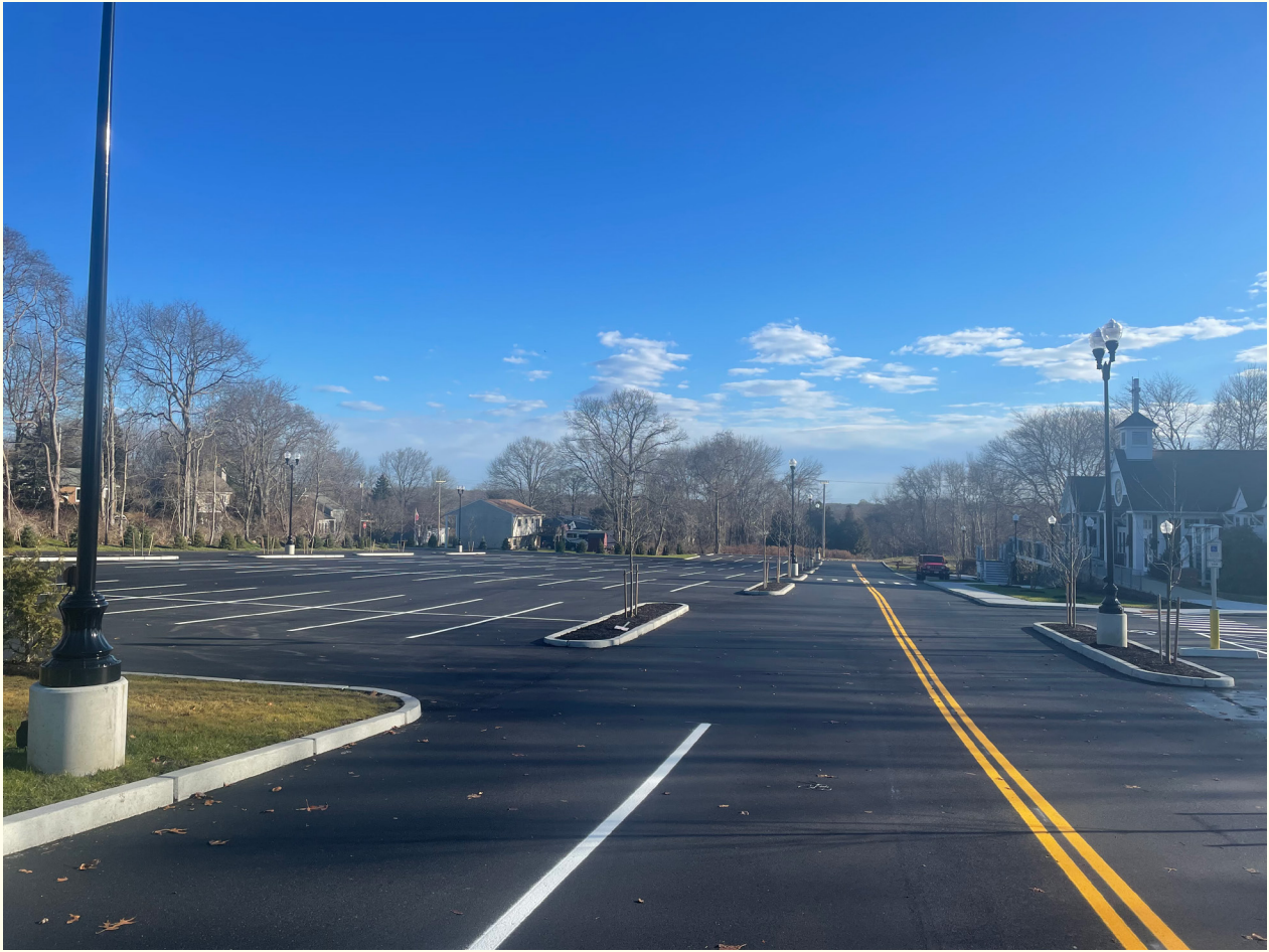
Our parking lot restoration project is coming to a close. Recently the lines were painted and all signage is up. Soon the gates will be installed on both back exits.