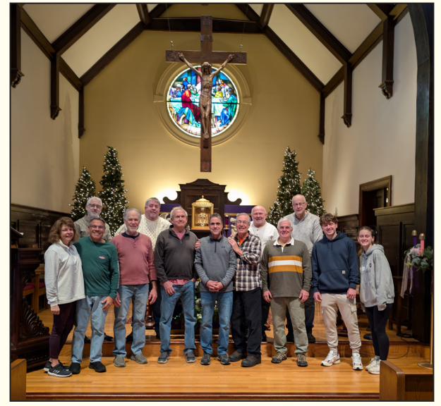
St. Veronica Chapel