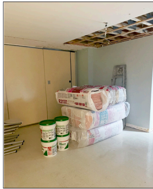
New materials have begun to arrive at St. Veronica to continue with the water damage restoration.