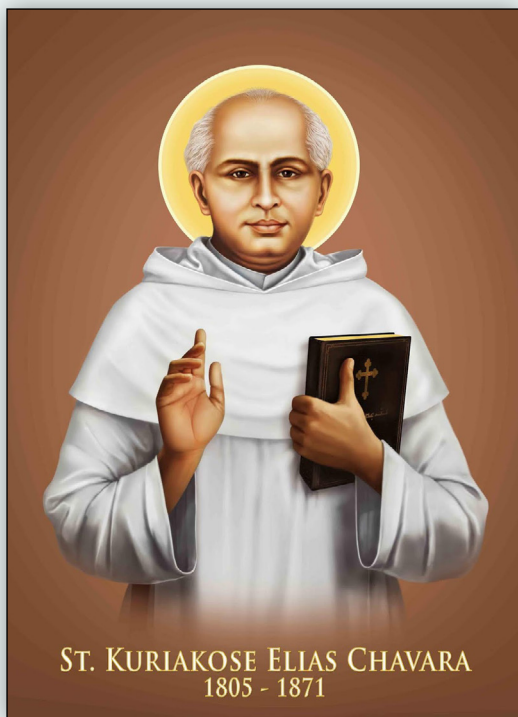
ST. KURIAKOSE ELIAS CHAVARA 1805 - 1871

Wednesday, January 3, 2024 Holy Mass and Novena 9:00 AM