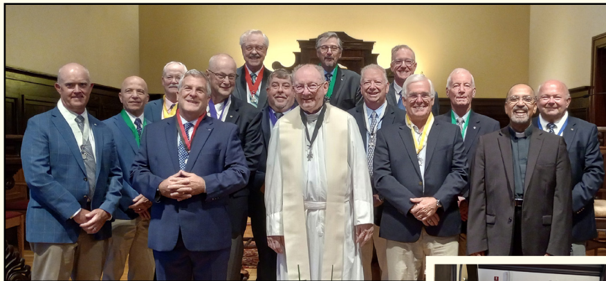
2024-25 Knights of Columbus Installation of Officers from their ceremony on August 12th

One such project is fundraising for 30 additional solar hot water systems for Jacob's Ladder. They've already funded 6 systems that were installed earlier this year. For additional information, visit www.popepiusxii.org . Their next trip to Jacob's Ladder is scheduled for November, 2024.