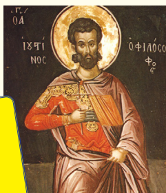
St. Justyn Martyr