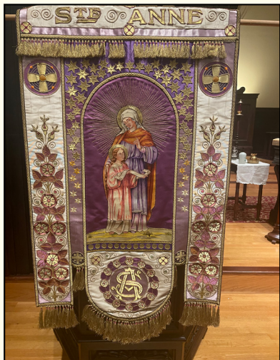
Celebrating the Feast day of St. Anne at St. Thomas More.