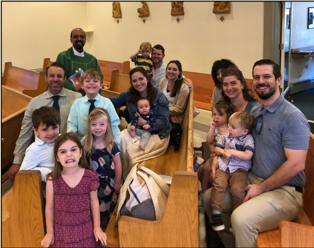
A family visiting from Connecticut joined us for Holy Mass at St. Veronica Chapel.