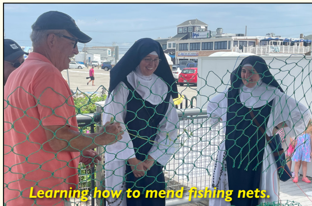
Learning how to mend fishing nets.