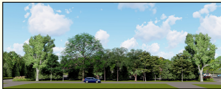
View of the parking lot from Carol Lane (adjacent to St. Veronica) upon completion.

The parking lot at St. Veronica Chapel will be going through a significant improvement project starting in April 2023, lasting through the summer with projected completion for September.