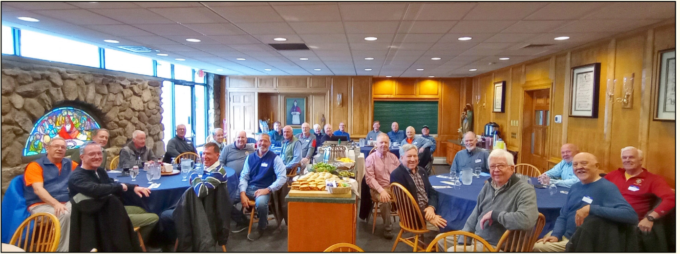
Last weekend the Knights of Columbus held their annual Men's retreat at Enders Island in Mystic, CT with Msgr. Halloran.