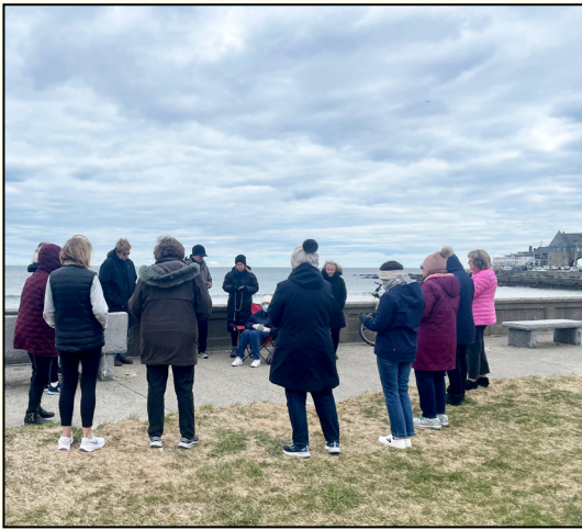
Divine Mercy Sunday rosary at the entrance of Narragansett Beach and Adoration at St. Thomas More Church.